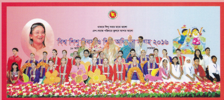
Sheikh Hasina Ensures Child Protection, Promotes Immense Possibility of Children

Under the leadership of Honorable Prime Minister Sheikh Hasina, the overall activities are being carried out to implement the Vision 2021 for ensuring reduction of maternal and child mortality, ensuring children's nutrition, health, education and safety, elimination of child abuse, prevention of child trafficking, withdrawal and rehabilitation of children from hazardous work and empowerment of children.